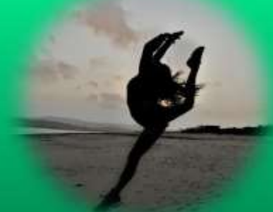
SCSD Dancer

Ballet, Tap & Disco/Street Dance Classes for children & Teenagers (Pre-school Ballet from age 2)