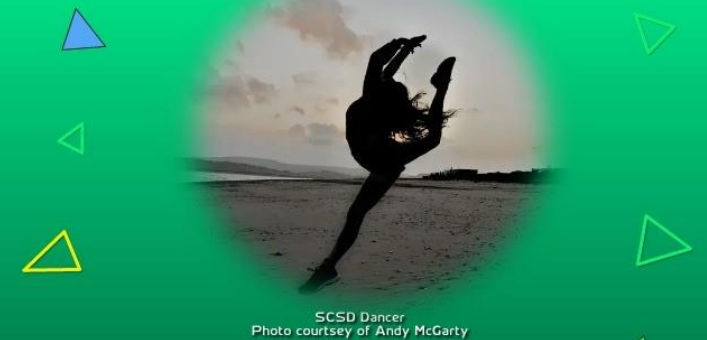
SCSD Dancer

Ballet, Tap & Disco/Street Dance Classes for children & Teenagers (Pre-school Ballet from age 2)