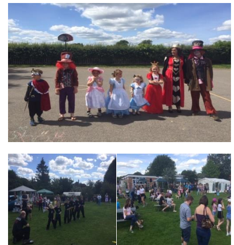
We appreciate the time and effort and support from everyone to raise funds for our school.