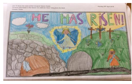
Thank you Holy Family - Years 1 and 2!