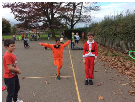
Father Christmas is starting early this year...

The children know that they need to work hard again this year to show the value of respect. They will receive respect tokens to go towards a whole class treat once their jar is full!