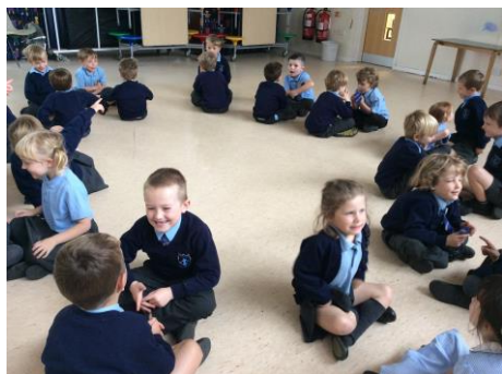
Holy Family in their PSHE lesson