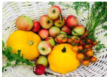
Some of our delicious produce....