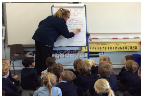
Year 1 in their writing lesson

It is so important that children know how to stay safe online. It is something that we take seriously at Our Lady's. The children will be asked to sign an acceptable use statement that gives them rules for how to keep safe. We have one for KS2 children and an adapted version for the younger children.