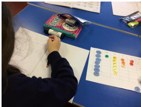
Maths in Year 4

Please also make sure that class teachers are spoken to in the first incident, rather than me, as Headteacher, as they should be your first point of call. This is not say that I do not want to know anything! On the contrary, but often the class teacher is more informed because of the day to day contact. Thank you.