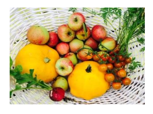
Some of our delicious produce....