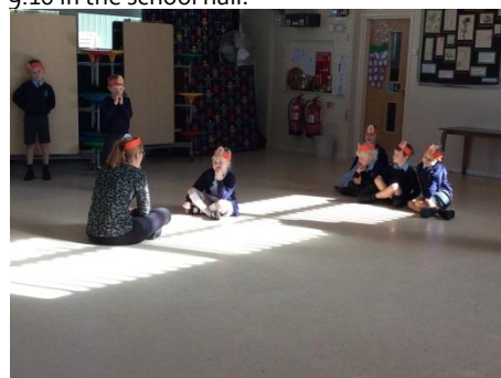
Year 2 role playing this week...