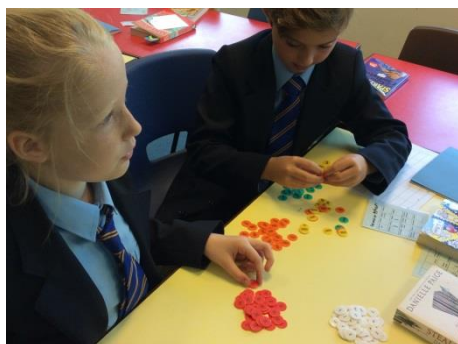
Maths in Year 6...

Attendance is crucial. Please ensure that your child arrives in time for registration please. Lateness is disruptive for all involved. Thank you.