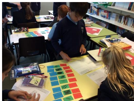
Science in Year 5 and 6

We are once again collecting for food bank this harvest. I will send out a separate letter detailing the sorts of foods that are suitable to donate in the next few weeks.