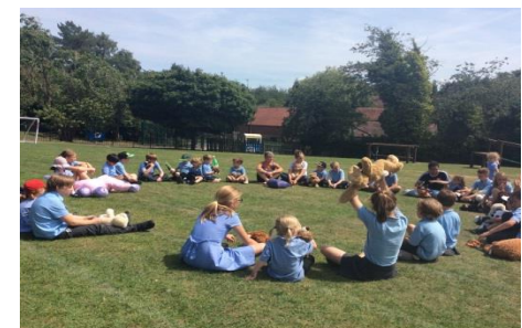
This week's special mentions

We had great fun decorating the hall for the Reception graduation and Year 6 Leavers Assembly!