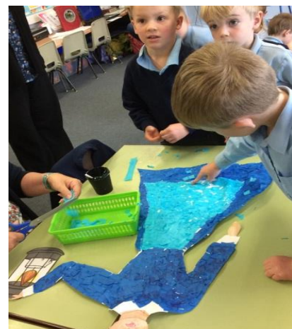
Some of our Year 1s creating their Florence Nightingale mosaic this week.

Wednesday 10 th May: First Holy Communion Meeting Wappenbury 6:30