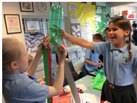
Some great teamwork and creativity in Year 5!

We will no longer be accepting old £5 notes from today. These will cease to be legal tender after Friday 5 th May 2017. Please cash them in at your nearest local bank or building society. Thank you.