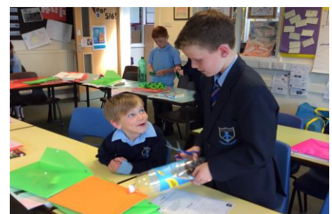
Reception and Year 6 working together in Science to make rockets.

Reminder Children should not wear nail varnish to school and long hair must be tied back.