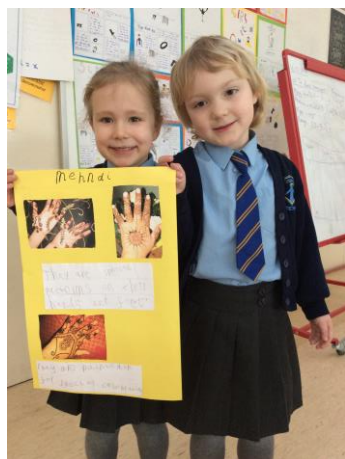
Brilliance in reception...

What brilliant week it has been at school, learning about the world's major faiths. The children have been so interested in all that they have learnt and have produced some top quality work.