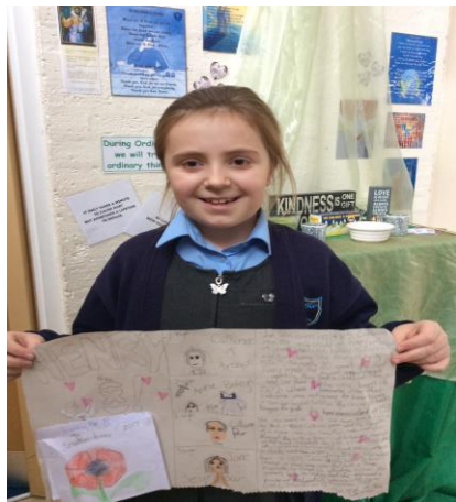
Some wonderful independent historical research, by Destiny ☺