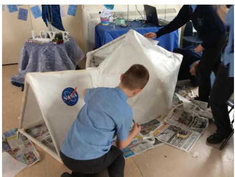
Wow....look at the results of amazing team work...☺