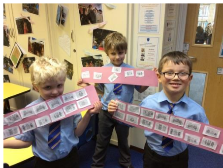
Year 1 have been busy sequences stories this week

Thank you also to the many children who attended Mass on Sunday, it was so lovely of you to bring toys that you no longer need, you are so generous and thoughtful.