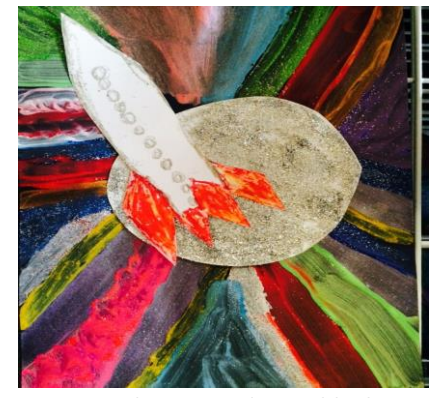
Some Peter Thorpe inspired art work by the juniors

It worries me that some children have come back from Christmas not in their full school uniform. I have had to speak to a number of children who do not have ties or correct PE kit. Uniform is compulsory and it helps to make our children distinctive and smart. Please ensure that your child is wearing the correct uniform next week.