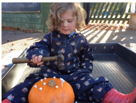
How gorgeous is this?!

Please do send back the Our Lady's Home School Agreement. Children succeed best when the school works collaboratively with parents and all other stake holders. We will be discussing this with your children too so that they fully understand what it means. It can also be found on the website.