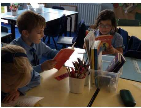
I can't believe my years 2s are now year

highest award for the recognition of all the hard work of so many. We have beautiful grounds and gardens and it is lovely that others have recognised that too.