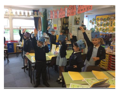
Year 1 in the roll of Max from 'where the wild things are'

There is also a school Mass at 9:30 on Friday 24<sup>th</sup> June. All are welcome.