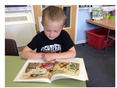
The joy of reading a good book

Sports day and the family picnic have been rescheduled to Thursday 7<sup>th</sup> July. The family picnic will start at 12:30 and the races will begin at 1:30. New reception parents are welcome to attend.