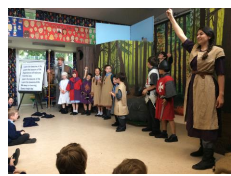
Merlin and the Sword in the Stone - our whole school theatre production

Just a reminder that children need their trainers everyday so that they can run their mile! Children are also having extra PE sessions over the next week in preparation for sports day and other sporting events that are taking place.