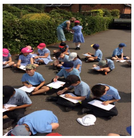
Year 3 and 4 on their environmental survey this week

Our next non-uniform day will be on Friday 24<sup>th</sup> June, where we would like to ask you to donate cakes, if at all possible, for the refreshments stalls at the fete.