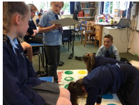
Year 6 relaxing after their exams...

We will receive the SATs results at the beginning of July and we will let Year 6 know the outcomes when we know.