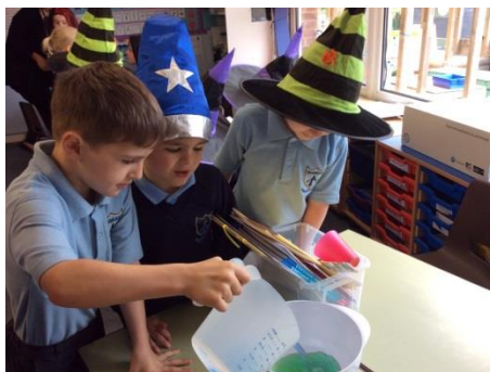
Excellence and Fun...