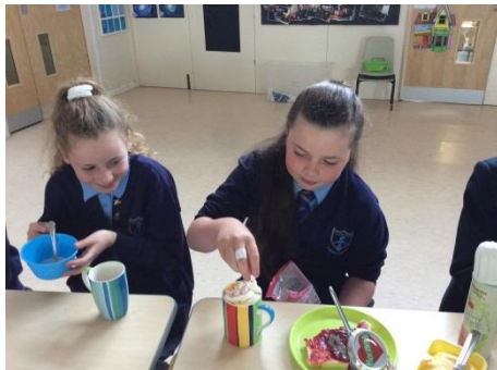
The Year 6s enjoying their breakfast

All the staff at Our Lady's are so proud of the way in which the Year 6s conducted themselves this week. They remained so calm and positive and even after the media hype on Tuesday morning they came in wanting to show off their learning.