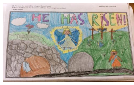
Thank you Holy Family - Years 1 and 2!