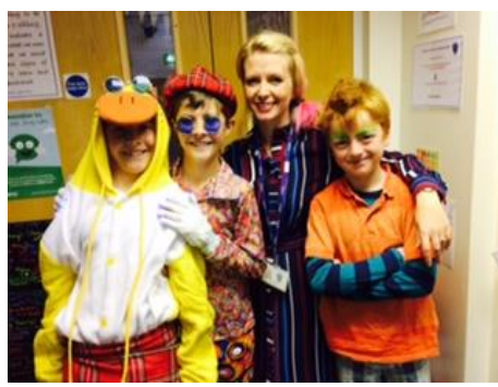
Thanks to the chaplaincy team for organising our 'Brighten Up for Harvest' We had great fun raising money for Cafod